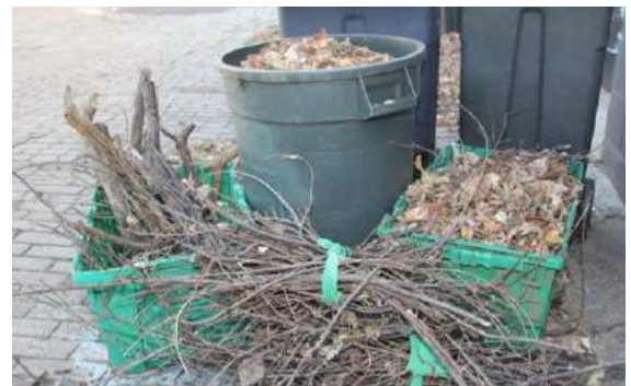
Reusable containers, paper bags, or tied bundles ONLY as of May 1 for yard waste!

Since May 1, yard waste in plastic bags has been tagged and left at the curb, requiring residents to place the yard waste material in paper bags, reusable containers, or bundles for collection on the next regularly scheduled collection day.